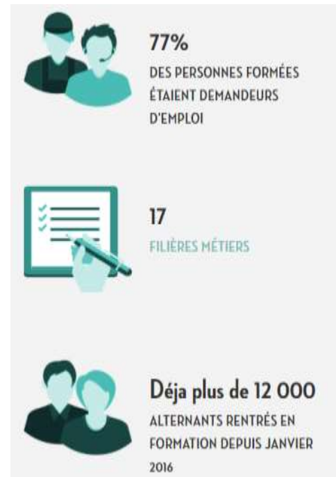
Figure 4 A summary of the results on the website

Still, programmes similar to the Grande École de l'Alternance have been implemented in other formats in other countries. Key components of the programme that should be replicated include ex ante analysis of the local labour market, the involvement of both the host company and training provider, and the double tutoring scheme. Nevertheless, funding is a significant challenge outside France. In previous attempts to expand the programme beyond France, it proved difficult to secure adequate funding, so the programme's implementation was limited and its impact quite small.