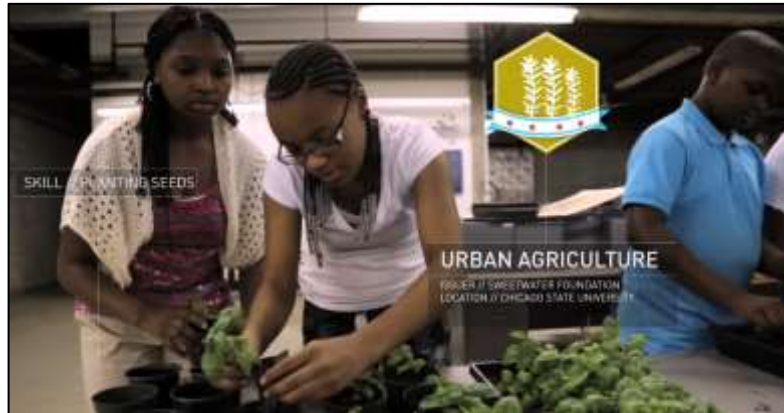
Figure 2 The Sweetwater Foundation issues the Urban Agriculture Badge for young learners in Chicago, Illinois

Moreover, there is growing interest in developing and validating micro-skills and soft skills. 21 Soft skills, such as teamwork, an innovative mindset and personal initiative, are increasingly important in the labour market. Open Badges can account for these and is very precise in specifying an individual's skills.