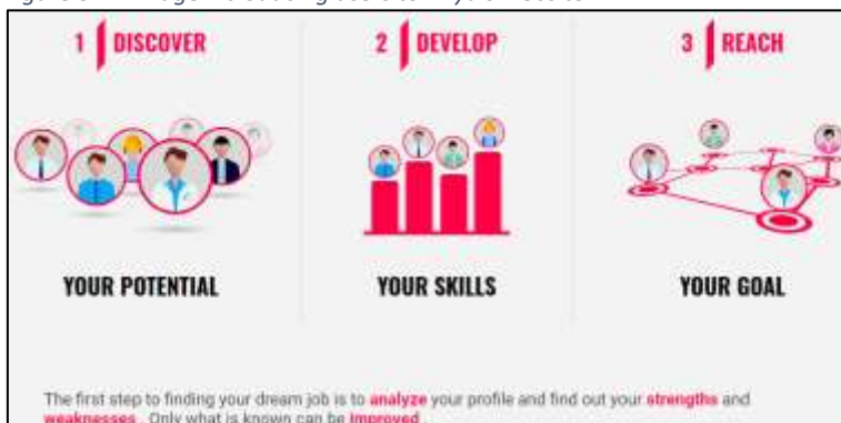
Figure 3 An image introducing users to Phyd's website

Phyd is technologically innovative, leveraging cloud computing and AI to process data on the local labour market and address employability and skill gaps. Through the assessment tools, the users' professional and educational information, and labour market data, individuals can gain an objective view of their position in their labour market (Figure 3).