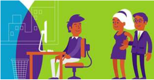
Figure 5 Four key areas of the DIS scan