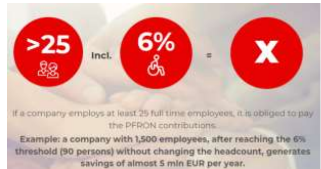
Figure 7 PFRON contributions

Benefits for workers, companies and society: As indicated above, the programme is beneficial for workers and companies, and its impact is also visible beyond these two groups. Workers benefit from improved integration in the labour market and can rely on the benefits connected with having a disability certificate. For companies, there are significant economic and non-economic benefits. The economic benefits include exemption from PFRON contributions, which can be quite high for larger companies as illustrated (Figure 7), as well as reimbursement of costs related to the use of equipment at the workplace or workplace adaptation, additional financing for the remuneration of employees with disabilities and their assistants, and the co-financing of training costs for these employees. The non-economic benefits for companies could encompass improved branding, corporate social responsibility, recruitment of loyal and motivated employees, etc. Job Impulse further collaborates with civil society organisations to ensure support and take-up of the programme. In that way, the programme has a societal impact that extends beyond its users. In January 2020, Job Impulse launched a foundation to support its ambitions.