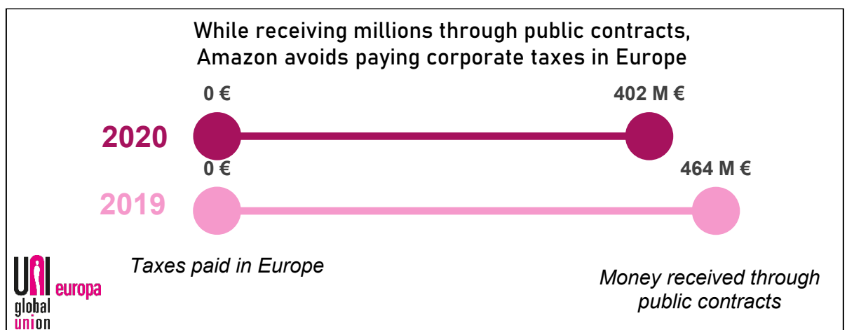
Figure 3 - Corporate taxes paid by Amazon in Europe vs. money received through public contracts